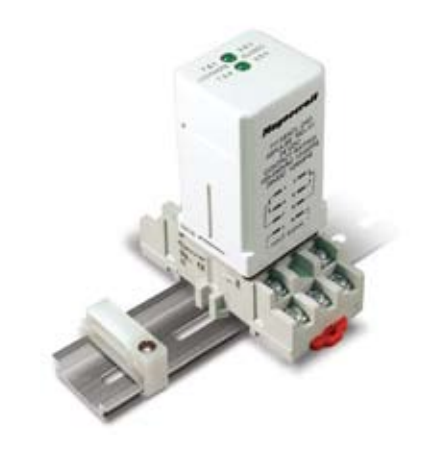
711 Relay with the 70-463-1 Socket