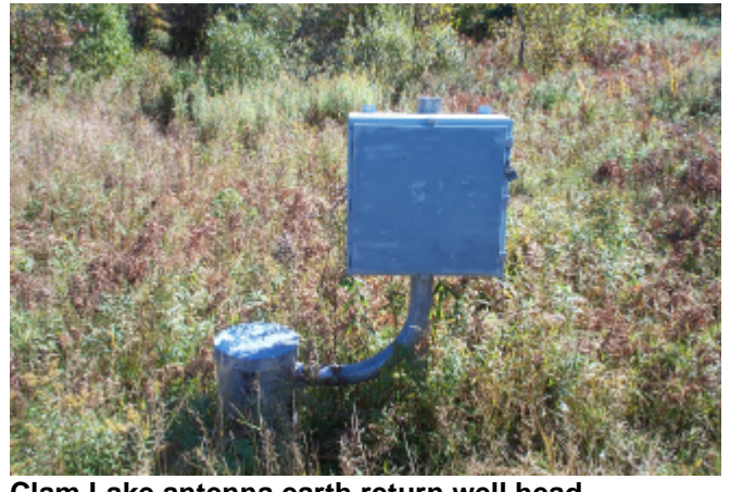
Clam Lake antenna earth return well head

Based on the success of this previous ground terminal upgrade work, the Navy anticipates replacing the other existing grounds for the antenna at the Clam Lake site in the next several years. In conjunction with these