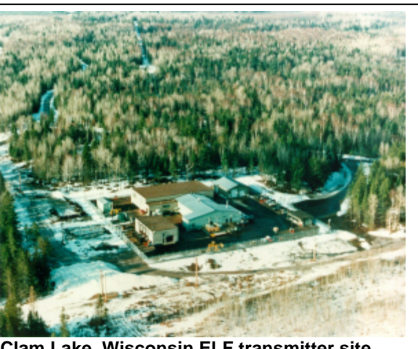
Clam Lake, Wisconsin ELF transmitter site