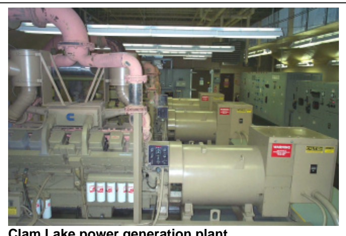
Clam Lake power generation plant

The Navy estimates the local economic impact of the Clam Lake facility to be approximately $6,000,000 annually. The Clam Lake facility, is staffed by two NCTAMS LANT civil service employees and about 30 contractor employees. The facility spends about $2,000,000 per year in employee payroll and local supplies and services (FY2000). The site staff operates the transmitter facility, conducts maintenance on the equipment and antenna system, and maintains the antenna right of way. The facility purchases services and supplies such as electricity, trash removal, fuel for vehicles and generators, office supplies and materials locally. The Navy spends about $400,000 annually on electricity purchased from the local Wisconsin power utility. When the local Wisconsin utilities experience near peak electrical demand, the Naval transmitter facility can bring as many as three Cummins diesel